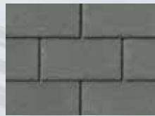
815 Sage Green