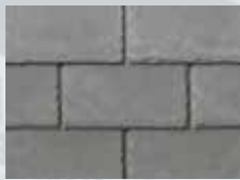
CR-731 Ash Grey