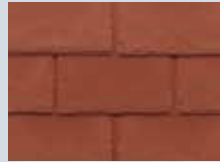
709 Brick Red