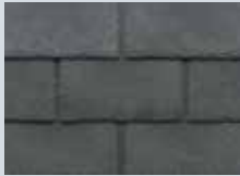
804 Pewter Grey