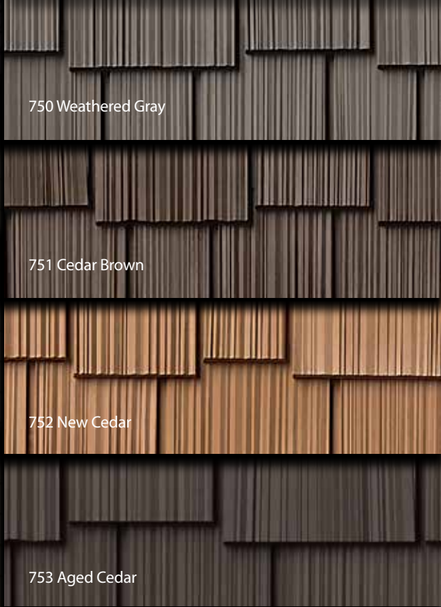
750 Weathered Gray