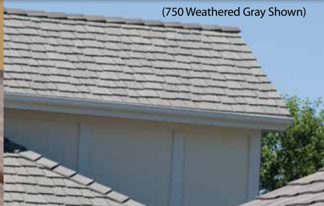
(750 Weathered Gray Shown)

Please note: TapcoShake is available as special order only, please contact us for availability/delivery times. Actual colours may vary from printed representation, samples are available on request.