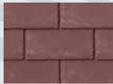
809 Red Rock