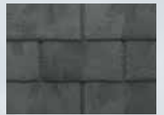
718 Grey/Black Blend